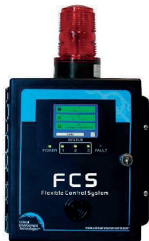
FCS shown with Options DL and L