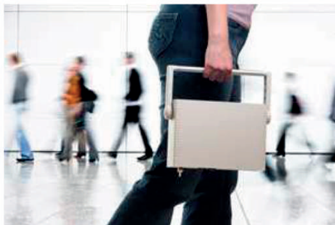
YES Plus LGA (picture above) is housed in a rugged ABS enclosure with swivel handle to act as a stand support or for carrying the instrument.