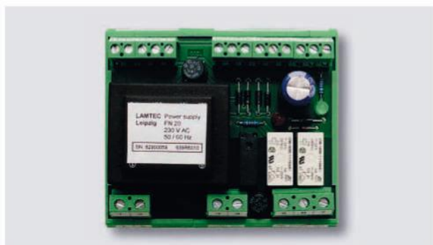
FN20 for top hat rail assembly FN20 in the connection housing with FSB connector, not shown.

The FN20 power pack includes an output relay adjusted for connecting the F200K compact flame scanner to 230 V or 115 V mains AC voltage. It must be installed in a way that enables it to attain an IP40 protection rating. The FN20 power pack is also available in an optional IP65 case.