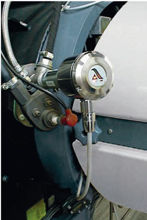
The LAMTEC F200K flame scanner in operation.

The F200K consists of a cylindrical case from corrosion-resistant aluminium EN AW 6082 containing an integrated flame sensor and circuit amplifier. Light enters on the axis. Users are able to make all settings independently. The device has received the IP67 protection rating and, as a result, is suitable for use in dusty or damp working environments. In addition to the standard design, it is also available in designs certified for use in Ex Zone I and II.