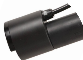
DO sensor fitted with an autoclean end cap

The OxySense Meter is the first of its kind in the world to offer automatic in situ sensor verification as an option. The OxySense is able to reduce maintenance by automatically checking it's sensor operation at user defined time intervals. Calibration on the In Situ sensor is normally required only once per annum so with the automatic sensor verification option and the self clean option the sensor may not need to be inspected at all for years!