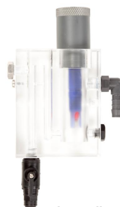
Flow Cell Mounted

The pHSense can be installed in a variety of auxiliary flow cells and self-cleaning devices. Please see the pH Selection guide (ISB56) available on our website, or if you are online, please click here .