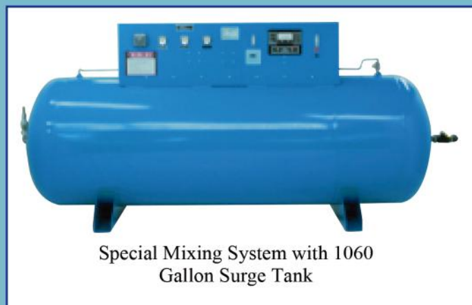
Special Mixing System with 1060 Gallon Surge Tank