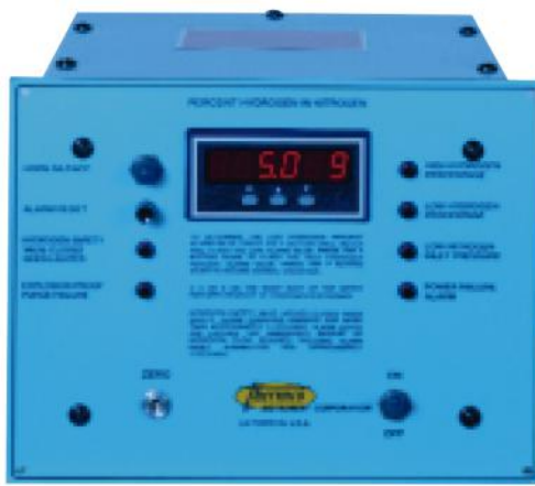
Model 9120 for Hydrogen/Nitrogen