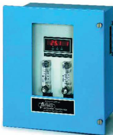
Model 7000 panel mounted analyzer