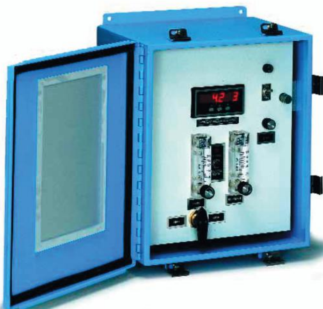
Model 7010 wall mounted analyzer with optional alarm package