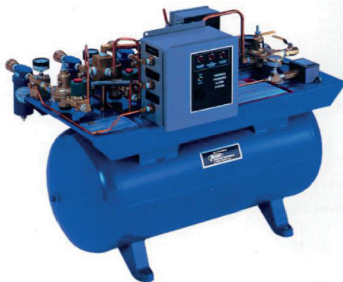
Model 8115 Shown with the pressure alarm system (Model 8110 is similar)