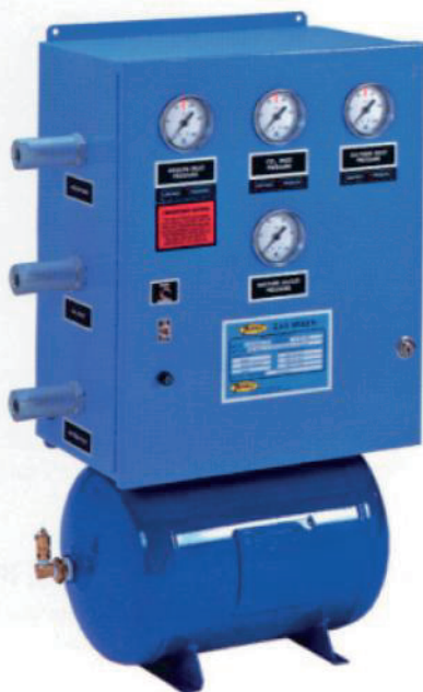
Model 8615 Shown with the pressure alarm system (Model 8610 is similar)

Models 8110, 8115, 8210, 8215, 8610, 8615